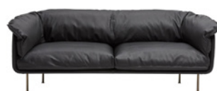
Winnie Sofa 200 FG 483.01