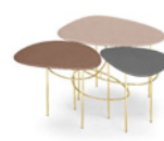
Vaie 3 FG 484.01