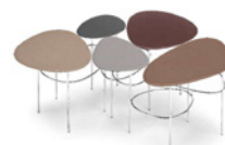
Vaie 5 FG 484.00