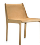
Nisida FG 342.00