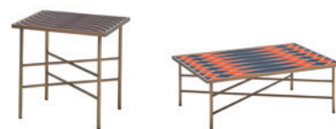
Motif 55 FG 509.00