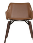
Iki PW FG 333.06