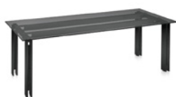
Bridge 240 FG 453.00