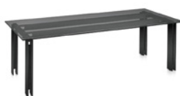
Bridge 270 FG 453.02