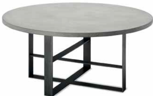
Table with steel base and concrete effect top.

Tavolo con base in acciaio e piano in effetto cemento.